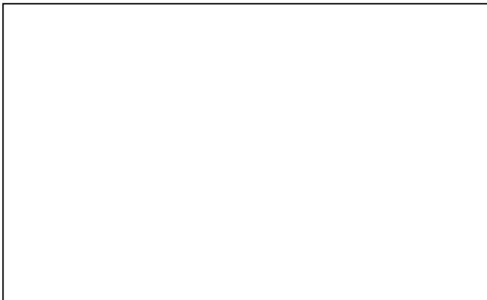
Sample of the A